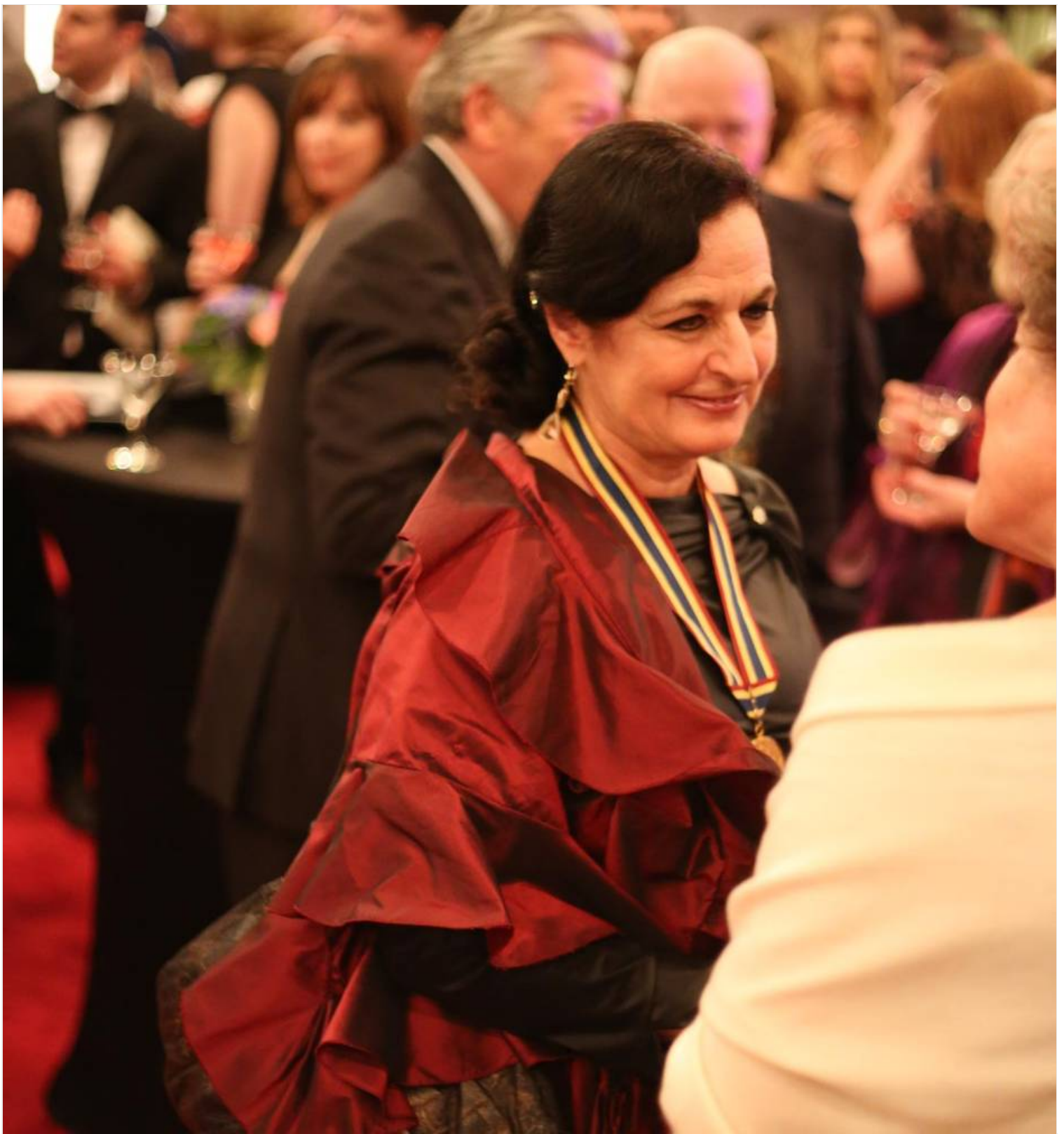
Past GGPAA recipient Veronica Tennant.