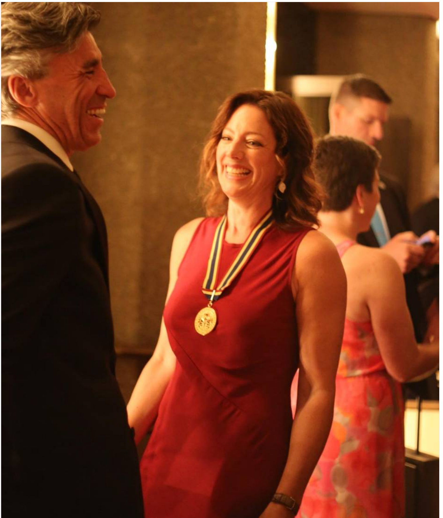
Sarah McLachlan and Geoff Courtnall.